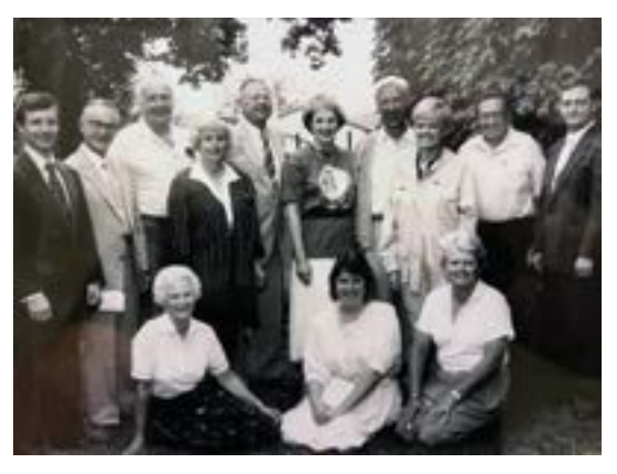
Memorial Foundation Founding Board of Trustees